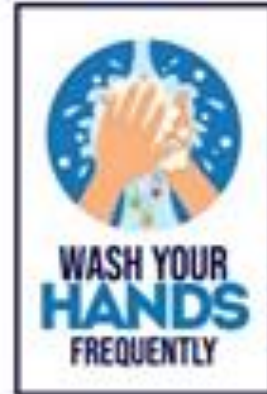
Wash Hands Frequently