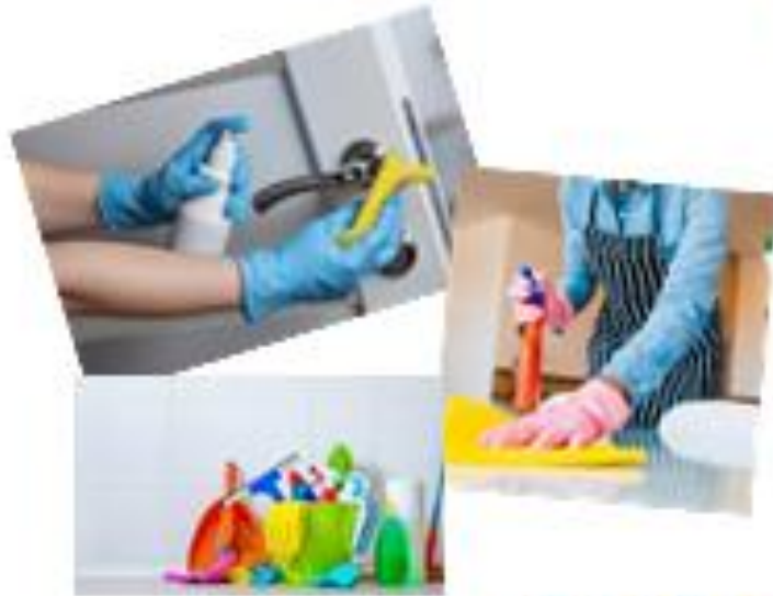
Clean, Clean, Clean