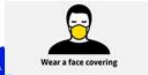
Wear a Face Covering in Social spaces