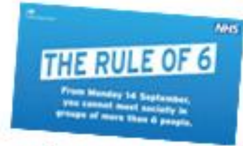
Only Meet in a Group of up to 6 people.