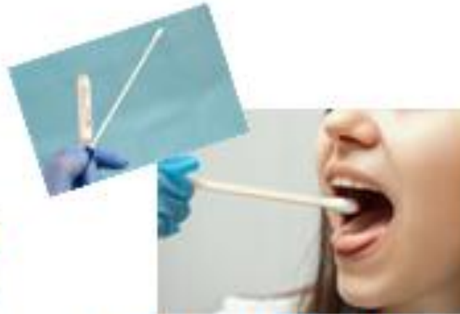
Covid test a sample from throat and nose