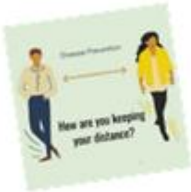
Socially Distance – 2m