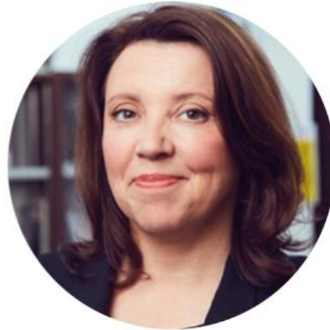
Dame Rachel de Souza

This survey will only take you 5-10 minutes .