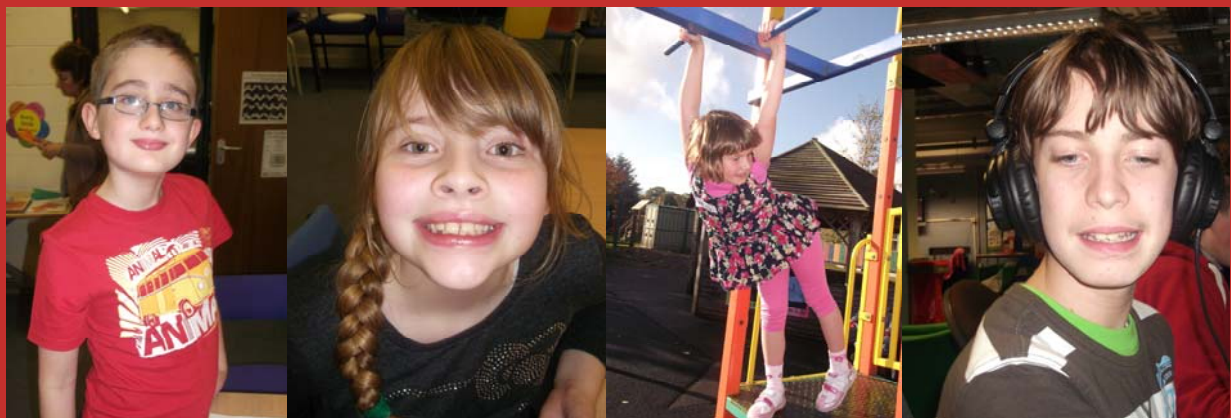
Young people attending October half-term holiday groups